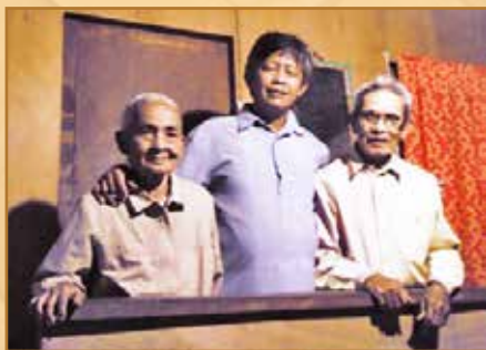
This elderly couple has listened to Hour of Grace for 18 years!

TCM-Philippines needs you! Although the work is well established and the members give sacrificially, they need your prayers and financial support. A USA donor who gave several thousand dollars a year for TCM-Philippines passed on recently. Who will step up and take his place? The church planting department is asking the Lord to raise up donors who will give $50 a month to support pioneer workers or $100 a month to cover office and travel expenses for the national youth director. You are invited to join TCM-Philippines in person or from afar on April 23-26 to celebrate God's faithfulness over the past 60 years!